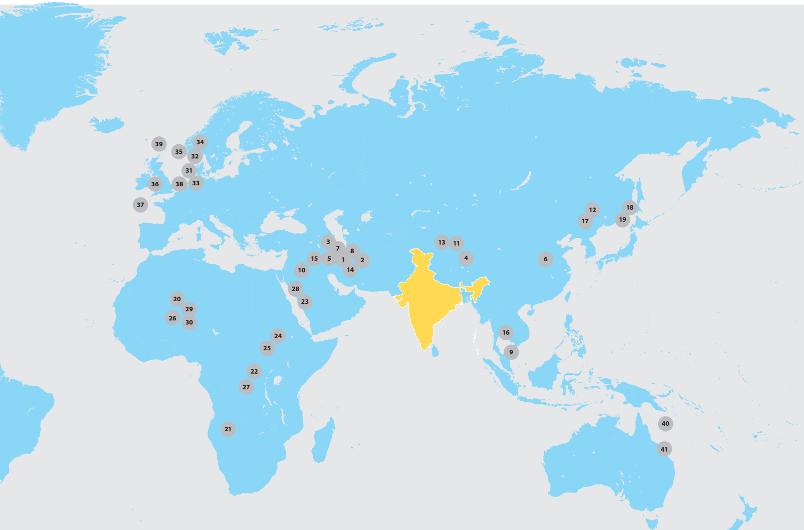
Map not to scale

25% Share of Revenue REST OF WORLD (ROW)