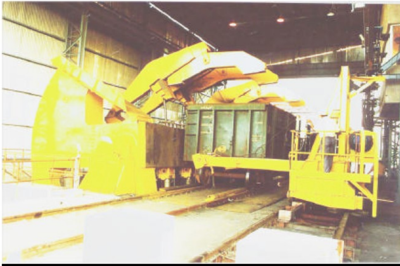
Typical Wagon Tippler with Side Arm Charger.