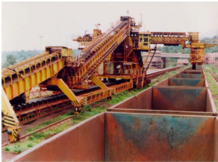
Typical Mobile Wagon Loader.