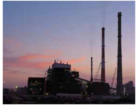
▲ Environmental impact assessment for 2 x 210 MW coal based power plant of Tata Power Company Limited at Jojobera