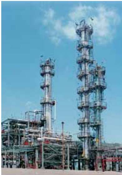
▲ Hazop study for food-grade hexane manufacturing plant (using sulpholane process) of Hindustan Petroleum Corporation Limited