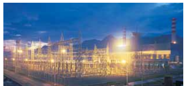
▲ Environmental due diligence report for 355 MW, Naphtha based Combined Cycle Power Plant for Kondapalli Power Corporation Limited