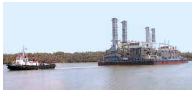
▲ Environmental due diligence report for India's first barge mounted 220 MW Combined Cycle Power Plant for PSEG India Private Limited