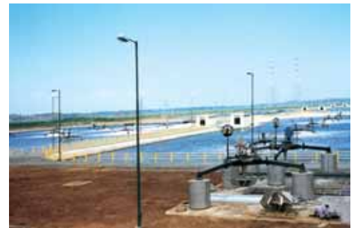
▲ Hazop study for the waste water collection, treatment and marine outfall for Brihanmumbai Municipal Corporation