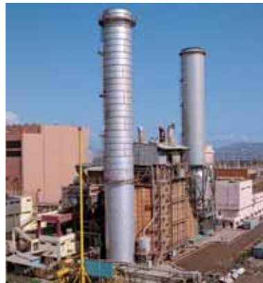
▲ Risk analysis for fuel storage facility adjacent to 205 MW Combined Cycle Power Plant, Tata Power Company Limited