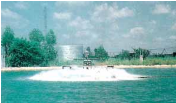
▲ Effluent treatment facility for Swadeshi Polytex