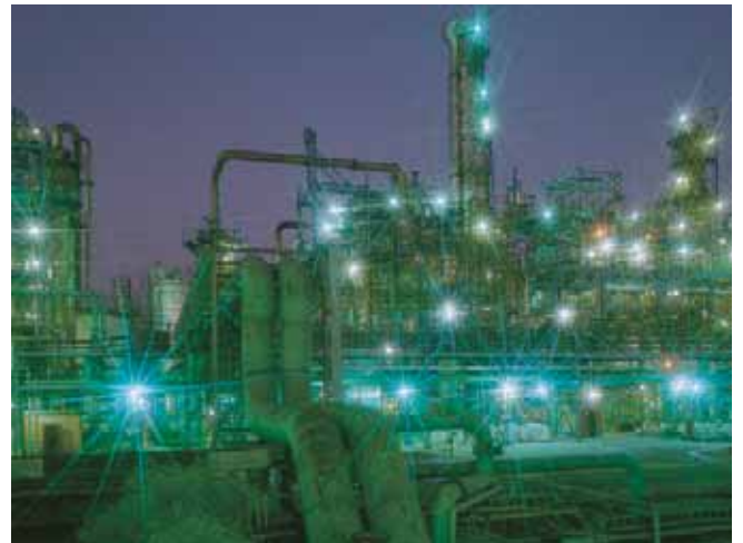
▲ Detailed design and engineering of effluent treatment facilities for DMT plant of Bombay Dyeing & Manufacturing Company Limited